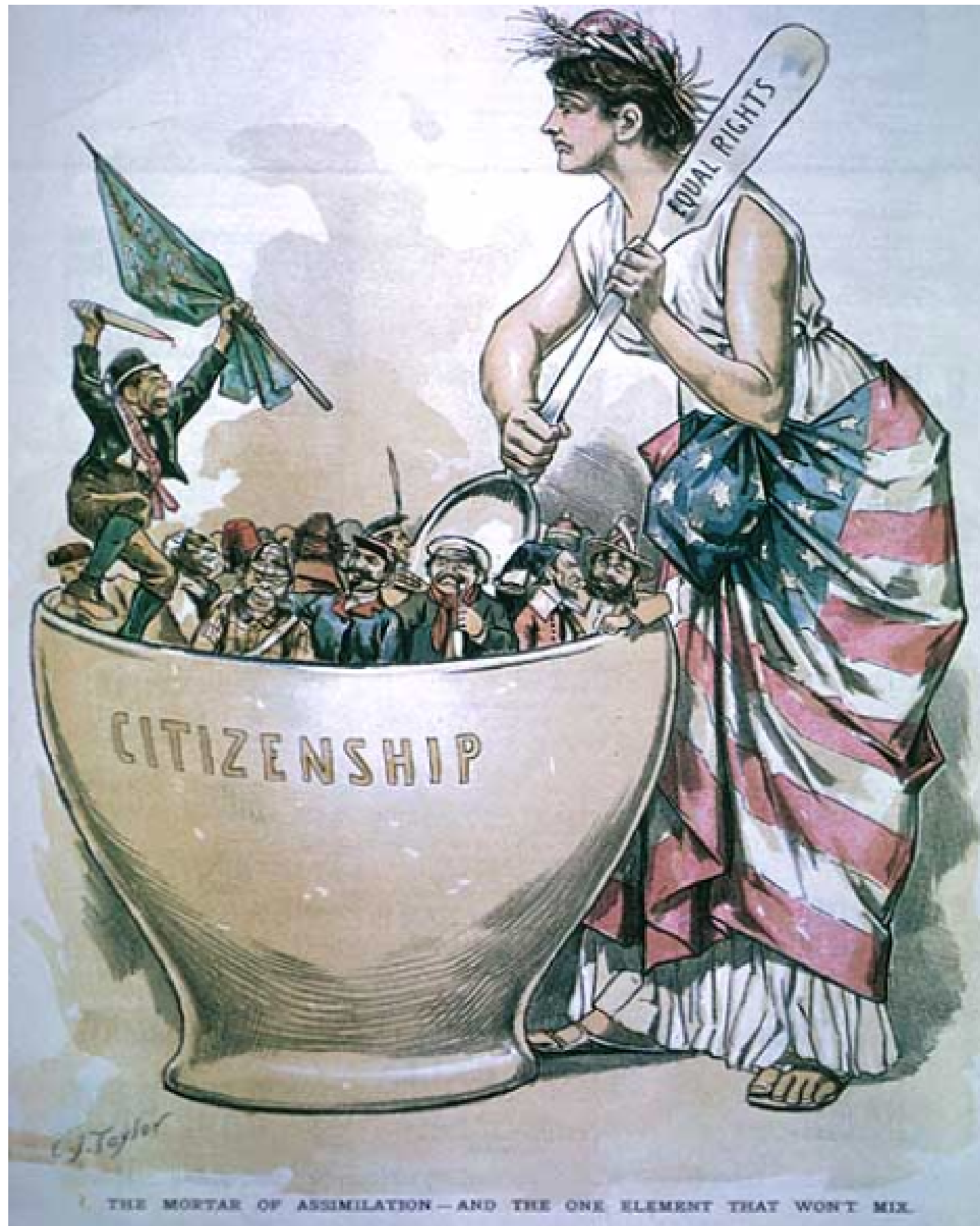
THE MORTAR OF ASSIMILATION - AND THE ONE ELEMENT THAT WON'T MIX.